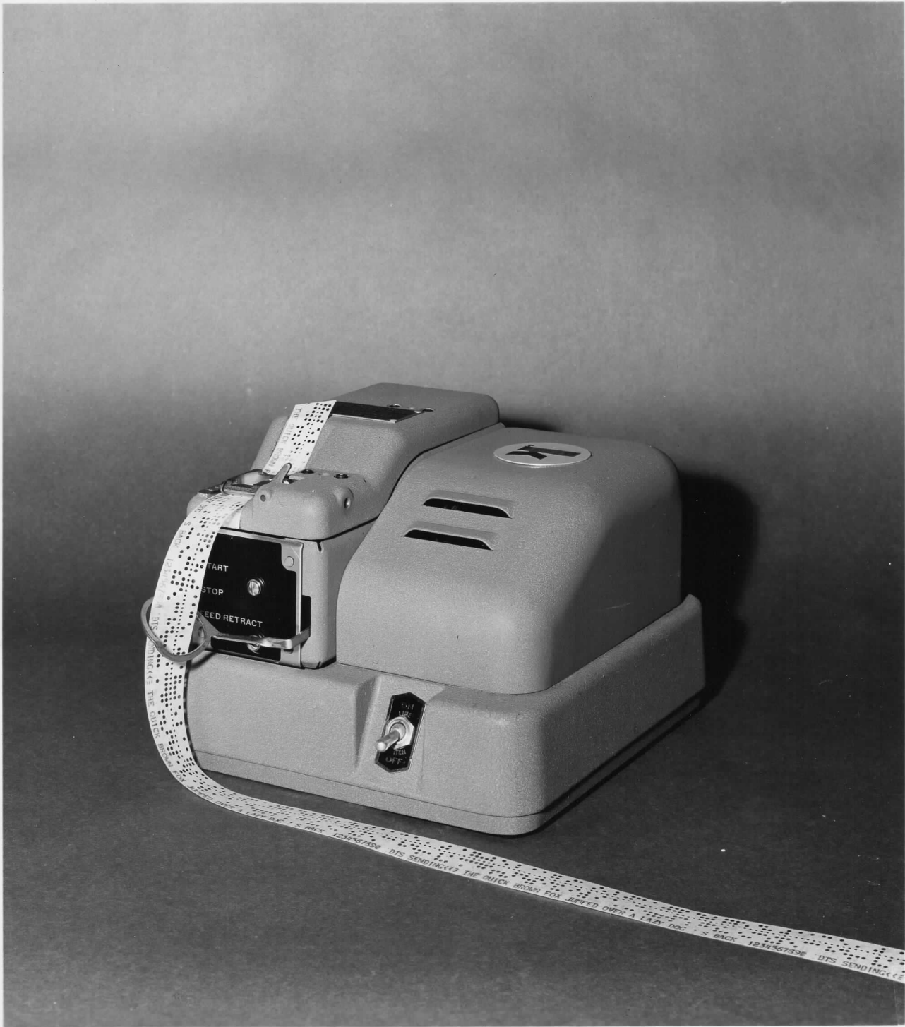
TAPE TRANSMITTER MODEL 140