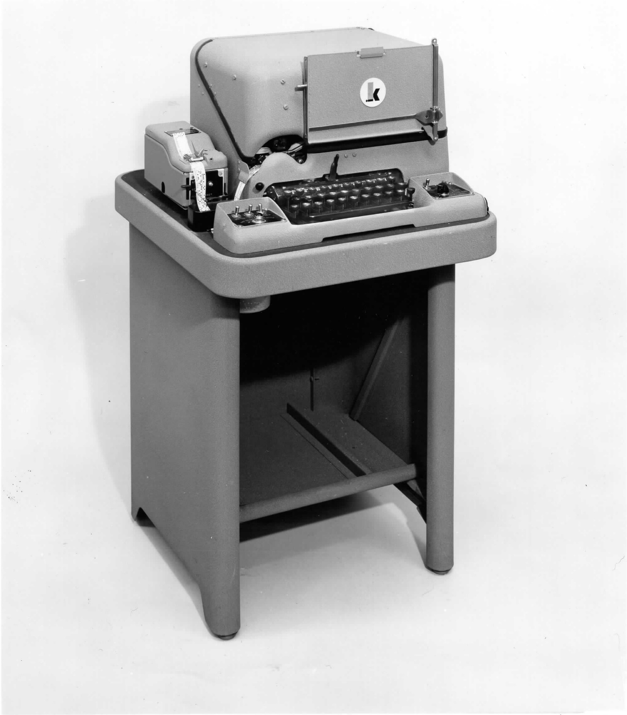
TYPING REPERFORATOR & TAPE TRANSMITTER MODEL 120