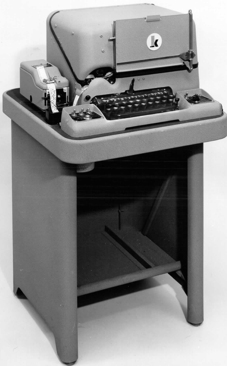
TYPING REPERFORATOR & TAPE TRANSMITTER MODEL 120