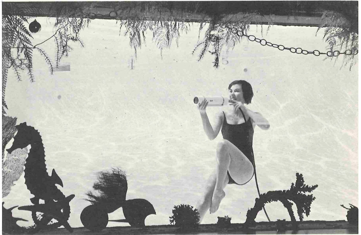
Cohu Electronics, Inc., 2000 Series TV Camera Being Demonstrated

The Aquarist Magazine for Hobbyists & Dealers