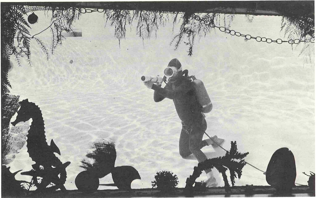
Another photo of the Cohu Electronics, Inc., Series 2000 TV Camera in Action

patched to a watery grave during the last 7 days of World War II was spotted.